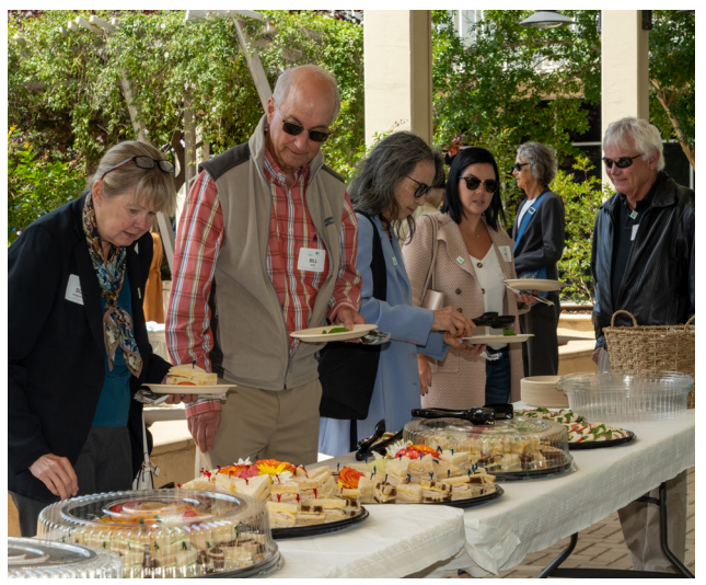
Attendees relishing a flavorful feast on the sunny patio!