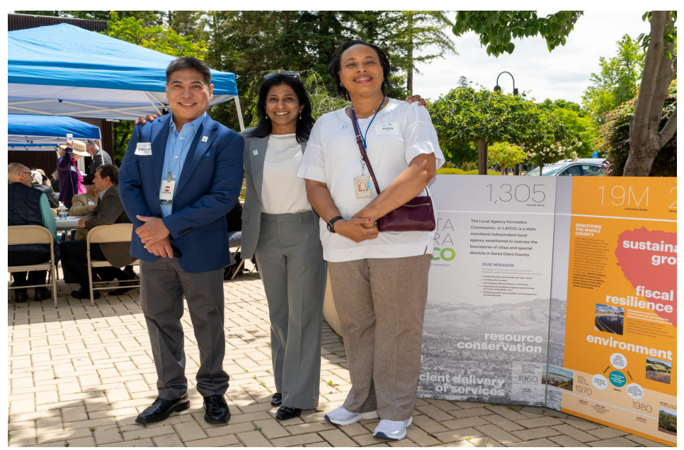
Cheers and cheers! LAFCO team soaking in the festive spirit!

It is anticipated that LAFCO's Countywide Fire Service Review will be completed by the end of October 2023. Per LAFCO's work plan for conducting its third round of service reviews, a countywide water and wastewater service review would follow.